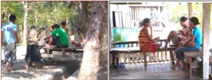
© At the edge of the road and on the porch stage