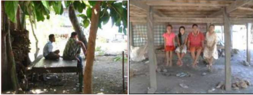
(a) In the backyard and underneath the house ( kolong )