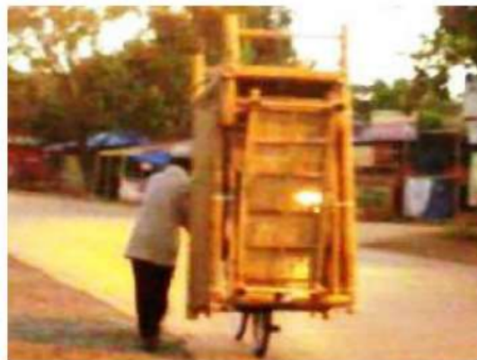
Fig. 4. Sell bale-bale with bike

The main principle of the bale-bale is a simple shape, light, and not too large (typically measuring 1m x 1.5 m), and the construction is easy to do. This causes easily moved or sold with bike. Figure which shows how to sale bale-bale by using bike around the town is a follow.