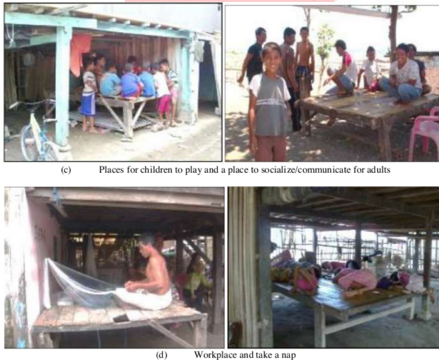
(c) Places for children to play and a place to socialize/communicate for adults