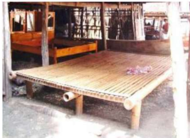
Fig.1. The shape of bale-bale

Bale-bale is a simple-designed place, easily moved, cheap, and easy to find which makes it usable by many people. The following is picture of bale-bale: