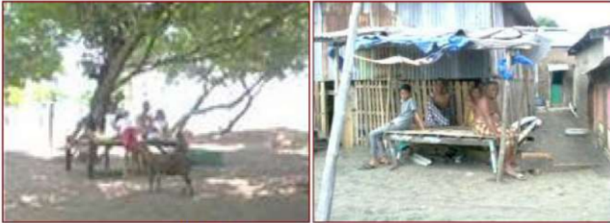
(b) Under the tree and open spaces around the coast